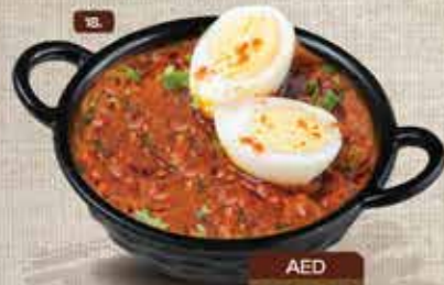
Egg Roast 5.00