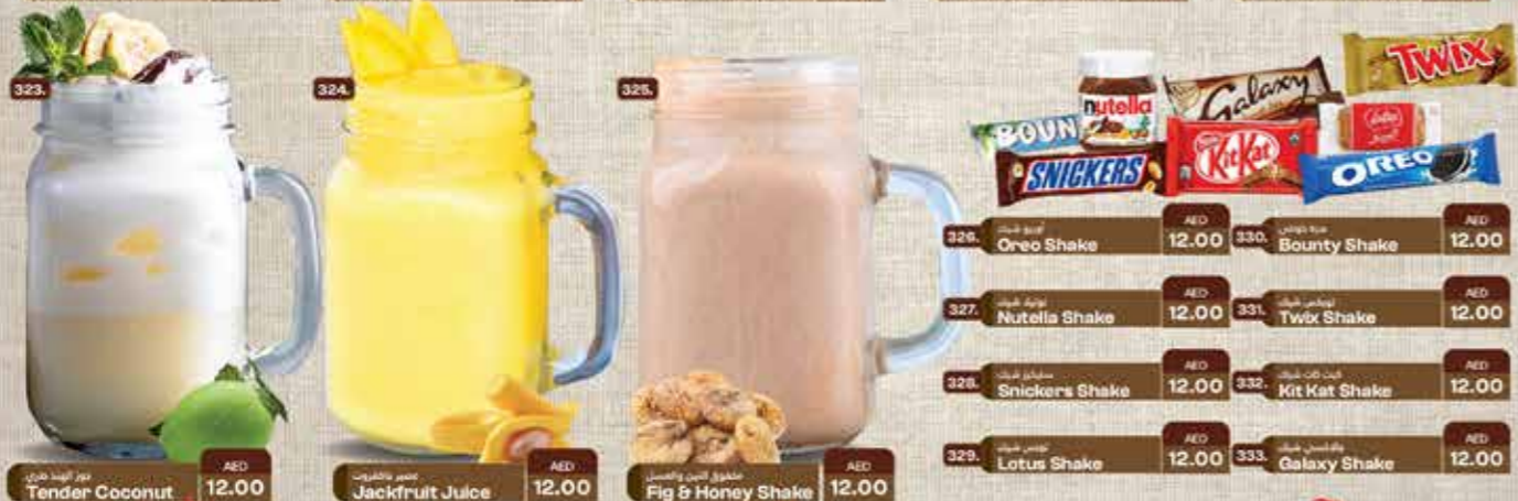
323. Tender Coconut AED 12.00 324. Jackfruit Juice AED 12.00 325. Fig & Honey Shake AED 12.00 326. Oreo Shake AED 12.00 327. Nutella Shake AED 12.00 328. Snickers Shake AED 12.00 329. Lotus Shake AED 12.00 330. Bounty Shake AED 12.00 331. Twix Shake AED 12.00 332. Kit Kat Shake AED 12.00 333. Galaxy Shake AED 12.00