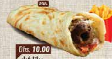
238. Kebab Porotta Dhs. 10.00