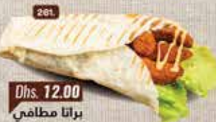
261. Fillet Wrap Dhs. 12.00