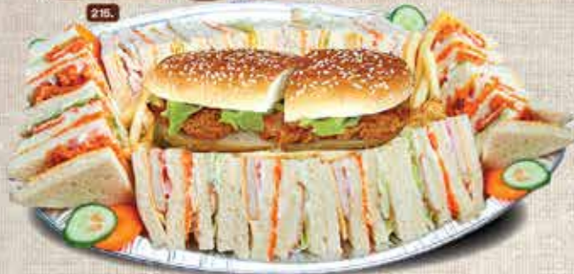
215. Green Sapphire Club AED 40.00

Club Sandwich, also called a clubhouse sandwich, is a sandwich consisting of bread (traditionally toasted), sliced cooked poultry, fried bacon, lettuce, tomato, and mayonnaise. It is often cut into quarters or halves and held together by cocktail sticks. Modern versions frequently have two layers which are separated by an additional slice of bread.