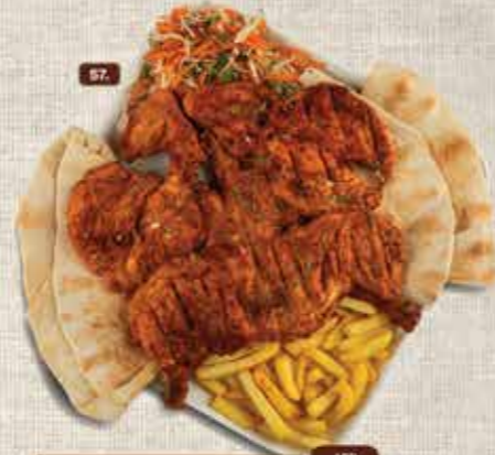
57. دجاج الفحم Chicken Charcoal