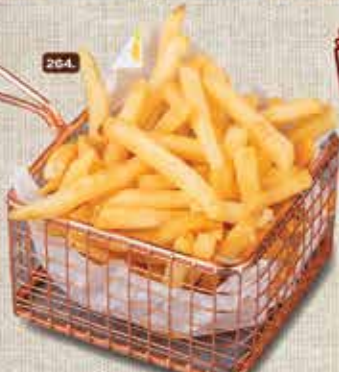
264. بطاطس مشاوية French Fries AED 5/8/10