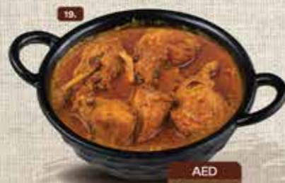
Chicken Curry 12.00