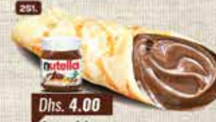
251. Nutella Porotta Dhs. 4.00