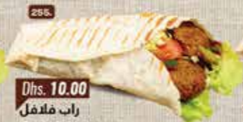
255. Falafel Wrap Dhs. 10.00