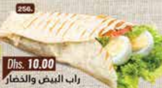
256. Egg & Veg Wrap Dhs. 10.00