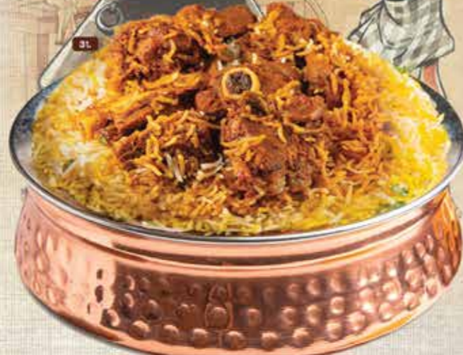
31. برياني لحم Mutton Biryani AED 18.00