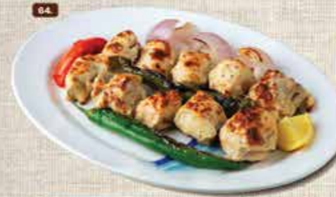
64. دجاج تكا زبادي Chicken Tikka Yoghurt