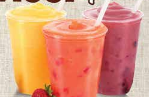
299. لاسي فراولة Strawberry Lassi AED 8.00