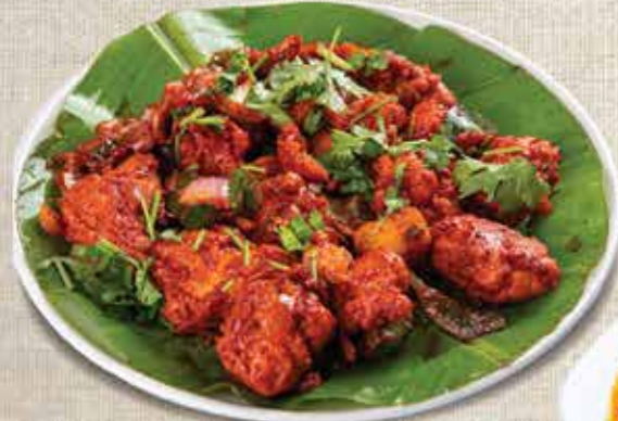
فطر فري Mushroom Fry AED 10.00