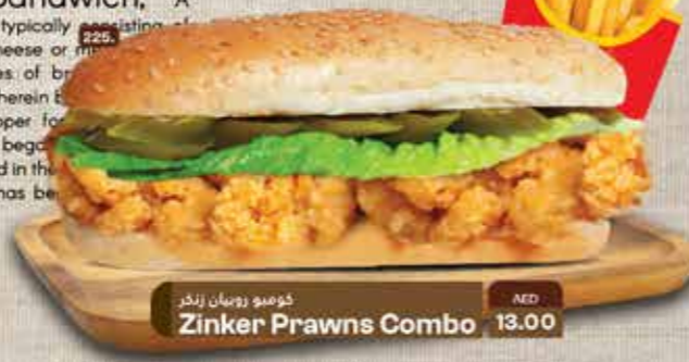
225. Zinker Prawns Combo AED 13.00