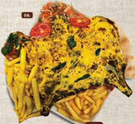
59. جرين سافاير خاص Green Sapphire S.P.