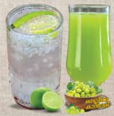
304. ناناري ساربات Nannari Sarpath AED 7.00