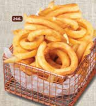
266. حلقات بطاطس Potato Rings AED 5/8/10