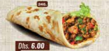
246. Nashif Porotta Dhs. 6.00