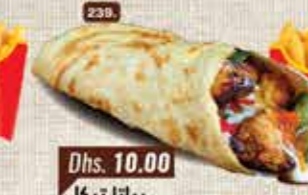
239. Tikka Porotta Dhs. 10.00