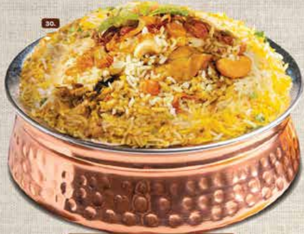
30. برياني دجاج Chicken Biryani AED 13.00