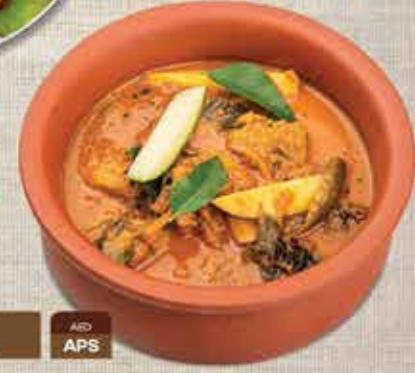
سمك مانجو كاري Fish Mango Curry AED APS