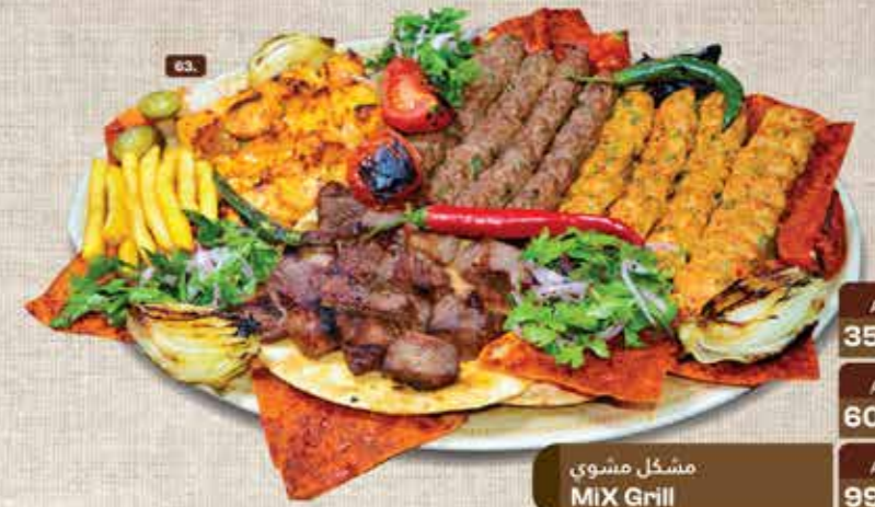
مشكل مشوي MIX Grill

Grilling is a form of cooking that involves heat applied to the surface of food, commonly from above, below or from the side. Grilling usually involves a significant amount of direct, radiant heat, and tends to be used for cooking meat and vegetables quickly. Food to be grilled is cooked on a grill (an open wire grid such as a gridiron with a heat source above or below), using a cast iron frying pan, or a grill pan (similar to a frying pan, but with raised ridges to mimic the wires of an open grill).