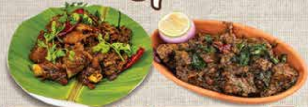
لحم فلفل مقلي Mutton Pepper Fry AED 18.00 لحم بالفلفل مشوي Mutton Pepper Roast AED 18.00