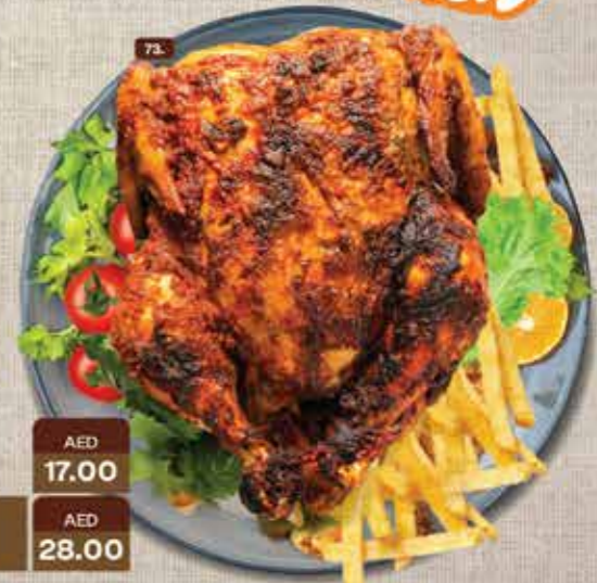
دجاج مشوي Grilled Chicken