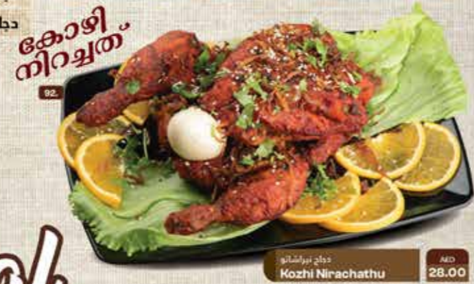
92. دجاج نيراشاتو Kozhi Nirachathu AED 28.00