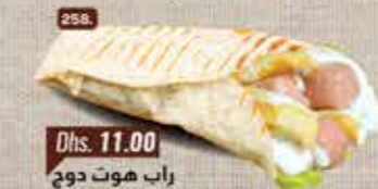
258. Hotdog Wrap Dhs. 11.00