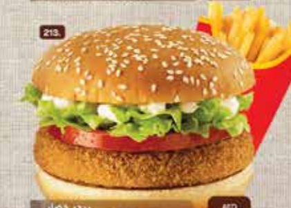
213. برجر خضار Vegetable Burger AED 8.00