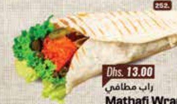
252. Mathafi Wrap Dhs. 13.00