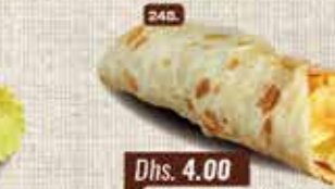
248. Oman Chips Porotta Dhs. 4.00