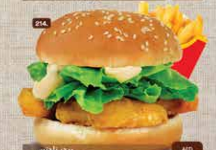
214. برجر ناچتس Nuggets Burger AED 9.00