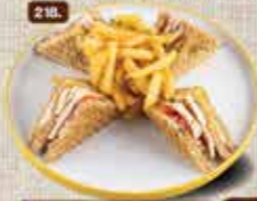
218. Avocado Diet Club AED 13.00