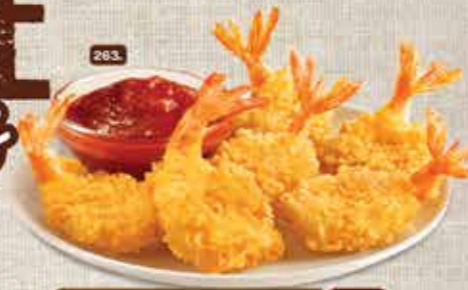
263. دوجان فراشة Butterfly Prawns AED 22.00