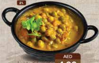
Green Peas 4.00