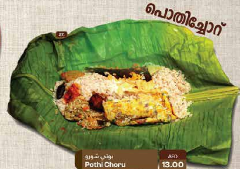
Pothi Choru 13.00