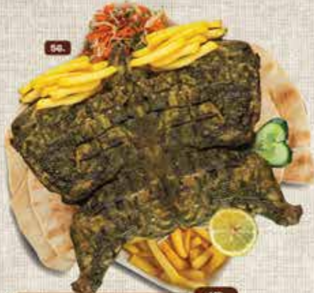
56. الفحم الفلفل الأخضر Green Chilli Charcoal