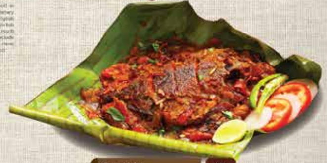
بوليشو سمك Fish Pollichathu AED APS