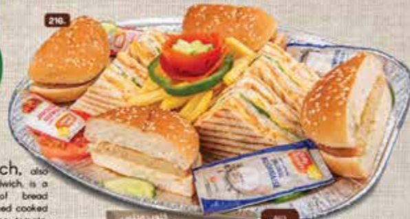
216. Majlis Club AED 35.00

Club Sandwich, also called a clubhouse sandwich, is a sandwich consisting of bread (traditionally toasted), sliced cooked poultry, fried bacon, lettuce, tomato, and mayonnaise. It is often cut into quarters or halves and held together by cocktail sticks. Modern versions frequently have two layers which are separated by an additional slice of bread.