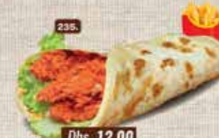
235. Mathafi Porotta Dhs. 12.00