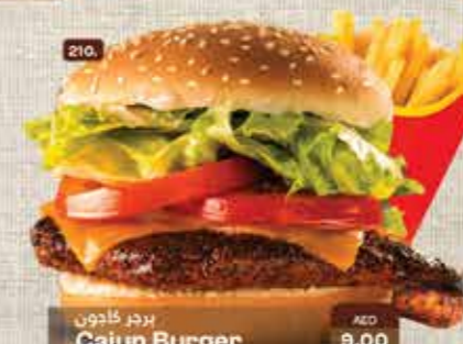
210. برجر كاجون Cajun Burger AED 9.00