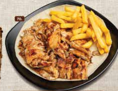
صحن شاورما Shawarma Plate