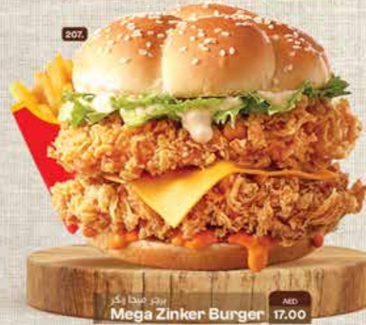
207. برجر ميجا زينكر Mega Zinker Burger AED 17.00