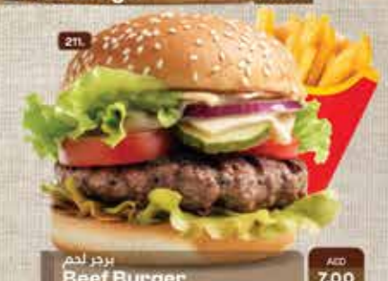
211. برجر لحم Beef Burger AED 7.00