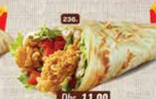
236. Zinker Porotta Dhs. 11.00