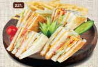
221. Vegetable Club AED 12.00