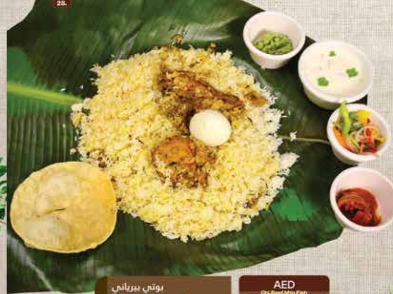
Pothi Biryani 14/19/19/APS