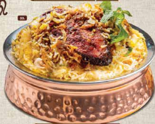
33. برياني سمك Fish Biryani AED 18.00