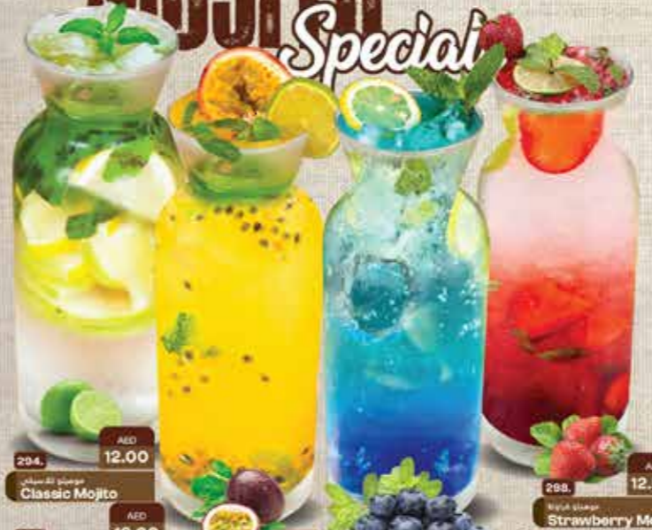
294. موشيتو كلاسيك Classic Mojito AED 12.00