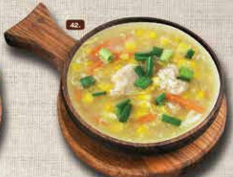
42. شوربة ذرة دجاج Chicken Corn Soup AED 10.00