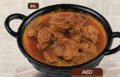
Beef Curry 12.00