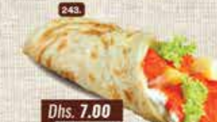
243. Chicken Chilly Porotta Dhs. 7.00