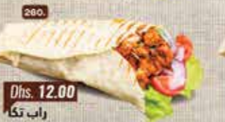
260. Tikka Wrap Dhs. 12.00