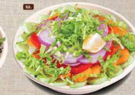
52. سلطة خضراء Green Salad AED 5/10