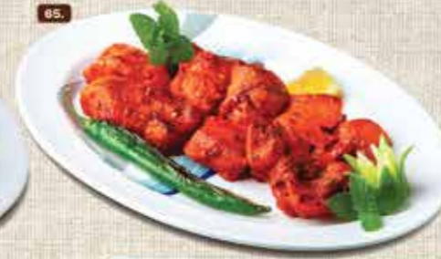
65. دجاج تكا Chicken Tikka