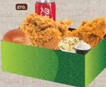
270. وجبة سناك Snack Meal AED 13.00