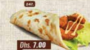
247. Fillet Porotta Dhs. 7.00