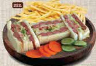
222. Hotdog Club AED 12.00