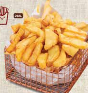
265. اساطير بطاطس Potato Wedges AED 5/8/10