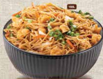
199. معكرونة دجاج Chicken Noodles AED 14.00