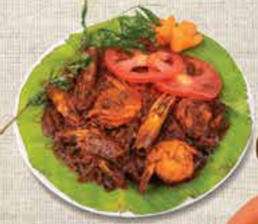
مشوي شميمين Chemmeen Roast AED APS