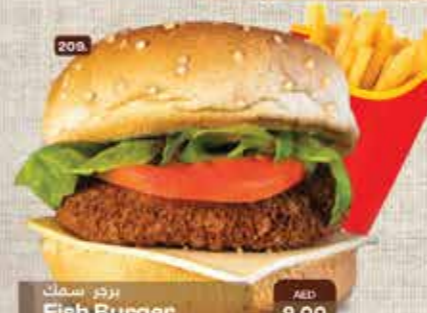
209. برجر سمك Fish Burger AED 9.00