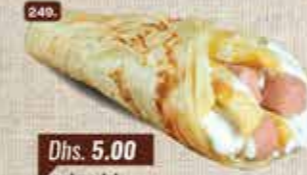
249. Hotdog Porotta Dhs. 5.00