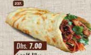
237. Cajun Porotta Dhs. 7.00