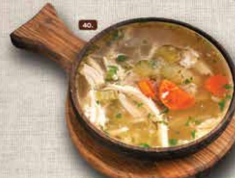
40. شوربة دجاج معكرونة Chicken Noodles Soup AED 10.00

Soup is a primarily liquid food, generally served warm or hot (but may be cool or cold), that is made by combining ingredients of meat or vegetables with stock, milk, or water. Hot soups are additionally characterized by boiling solid ingredients in liquids in a pot until the flavors are extracted, forming a broth. Soups are similar to stews, and in some cases there may not be a clear distinction between the two; however, soups generally have more liquid (broth) than stews.