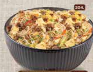
204. معكرونة مشكل Mixed Noodles AED 18.00