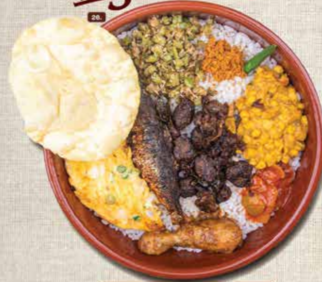
Chatti Choru Chi/ Beef 16.00