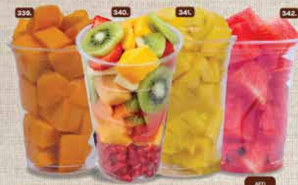
339. Mango Brick AED 10/12 340. Mix Fruit Brick 341. Pineapple Brick 342. Watermelon Brick