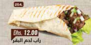
254. Beef Wrap Dhs. 12.00