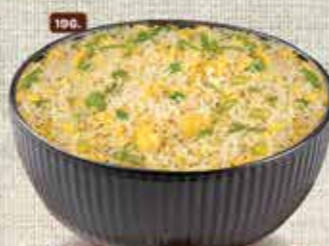
196. أرز مقلي بيض Egg Fried Rice AED 12.00