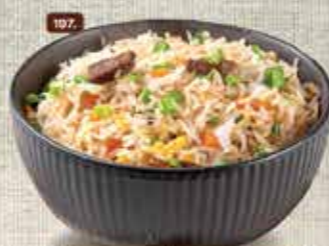
197. أرز مقلي مشكل Mixed Fried Rice AED 18.00