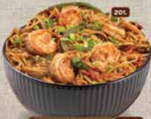
201. معكرونة روبيان Prawns Noodles AED 18.00