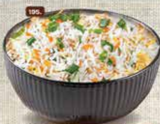
195. أرز مقلي خضار Vegetable Fried Rice AED 12.00