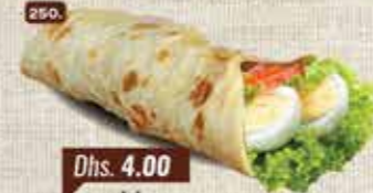
250. Egg Porotta Dhs. 4.00