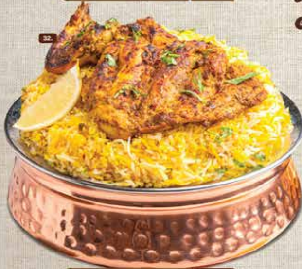
32. برياني على الفحم Charcoal Biryani AED 25/40