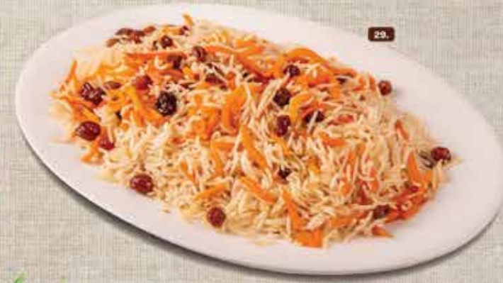
Vegetable Pulav 10.00