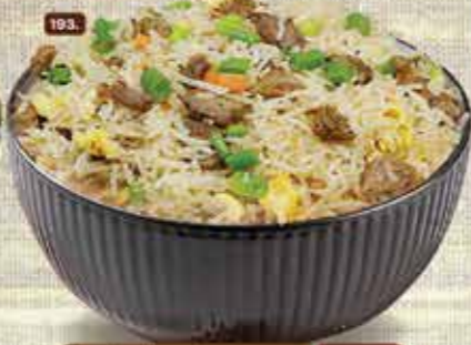
193. أرز مقلي لحم Beef Fried Rice AED 15.00