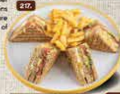
217. Veg. Diet Club AED 12.00