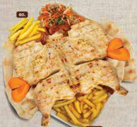
60. الفحم أفغانيس Afghani Charcoal