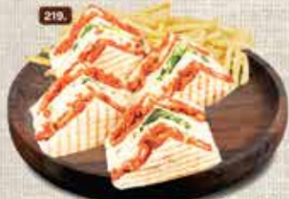
219. Zinker Club AED 12.00