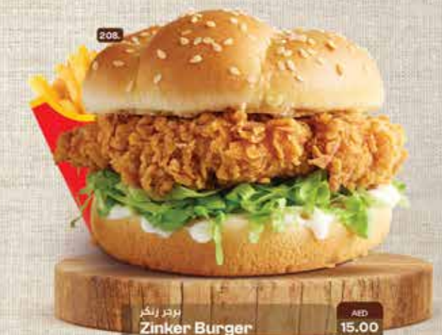
208. برجر زينكر Zinker Burger AED 15.00