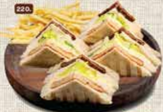
220. Special Club AED 12.00