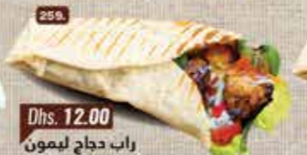
259. Chi. Lemon Wrap Dhs. 12.00