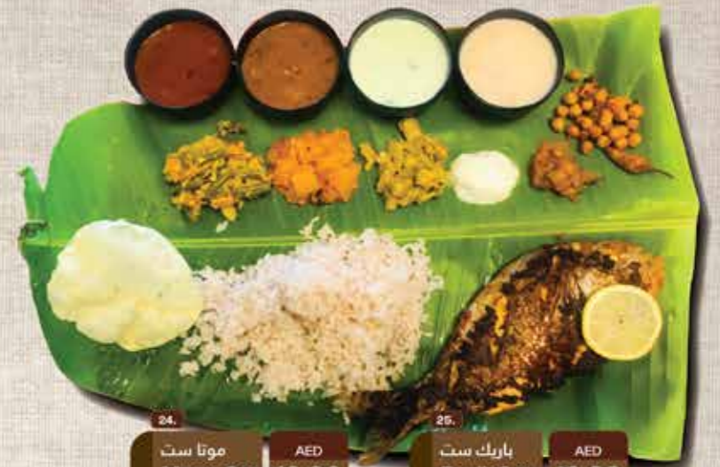
Motta Set 10.00