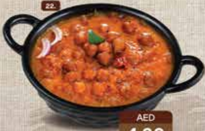
Kadala Curry 4.00