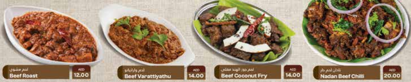
لحم مشوي Beef Roast AED 12.00 لحم وراتياتو Beef Varattiyathu AED 14.00 لحم جوز الهند مقلي Beef Coconut Fry AED 14.00 نادان لحم حار Nadan Beef Chilli AED 20.00