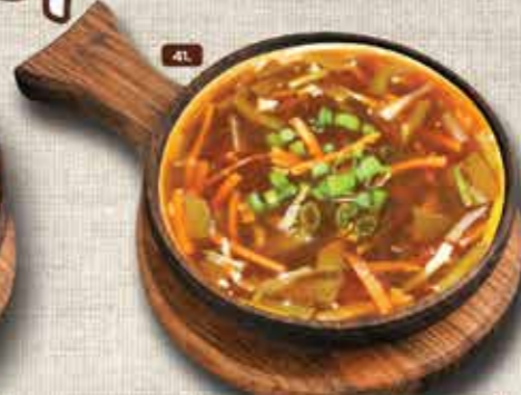
41. شوربة خضار Vegetable Soup AED 9.00