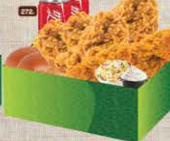
272. وجبة جاسمو Jumbo Meal AED 30.00