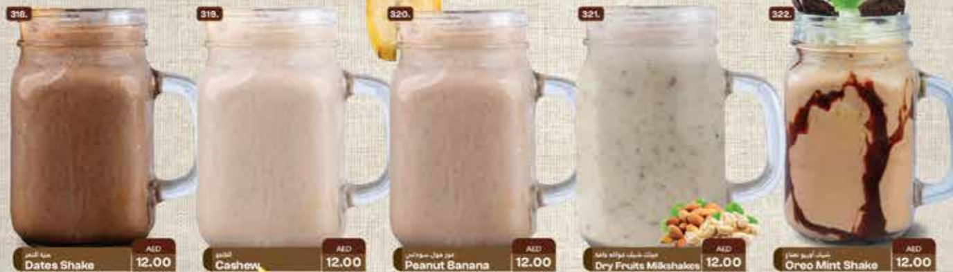
318. Dates Shake AED 12.00 319. Cashew AED 12.00 320. Peanut Banana AED 12.00 321. Dry Fruits Milkshakes AED 12.00 322. Oreo Mint Shake AED 12.00