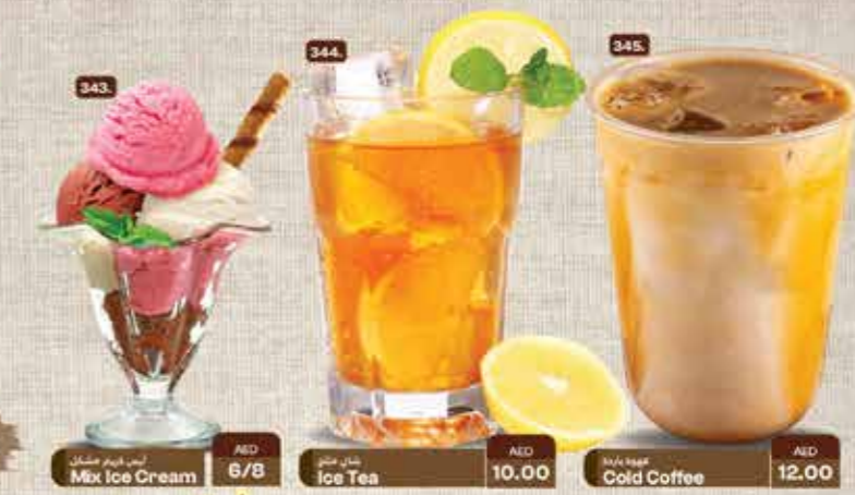
343. Mix Ice Cream AED 6/8 344. Ice Tea AED 10.00 345. Cold Coffee AED 12.00