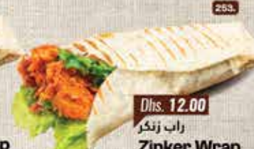
253. Zinker Wrap Dhs. 12.00