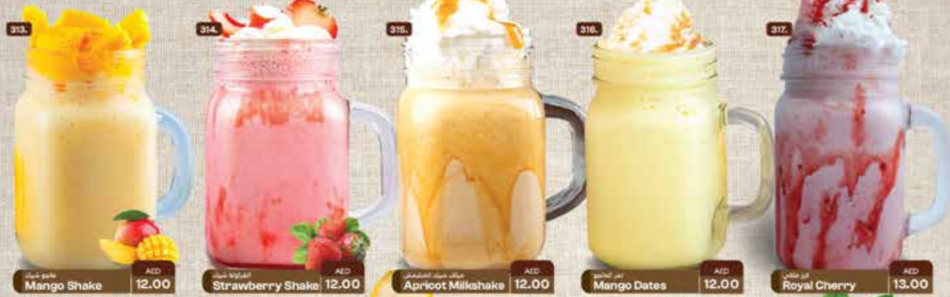
313. Mango Shake AED 12.00 314. Strawberry Shake AED 12.00 315. Apricot Milkshake AED 12.00 316. Mango Dates AED 12.00 317. Royal Cherry AED 13.00