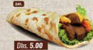
241. Falafel Porotta Dhs. 5.00