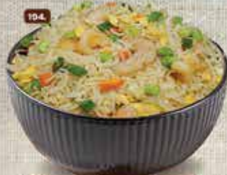
194. أرز مقلي روبيان Prawns Fried Rice AED 18.00