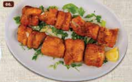
66. سمك تكا Fish Tikka