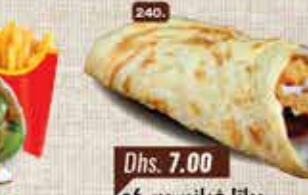
240. Francisco Porotta Dhs. 7.00