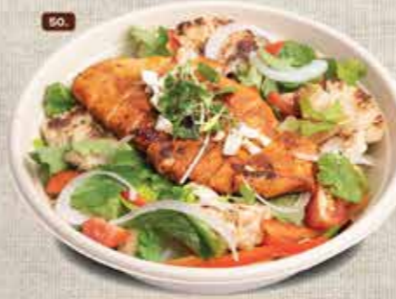
50. سلطة دجاج مكسيكي Mexican Chicken Salad AED 16.00

A salad is a dish consisting of mixed ingredients, frequently vegetables. They are typically served chilled or at room temperature, though some can be served warm. Condiments and salad dressings, which exist in a variety of flavors, are often used to enhance a salad.