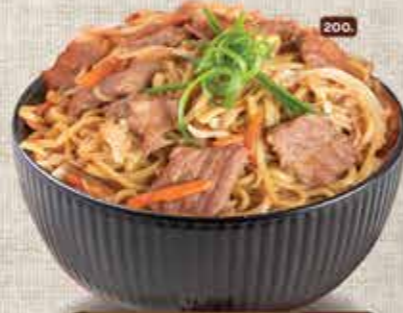
200. معكرونة لحم Beef Noodles AED 15.00