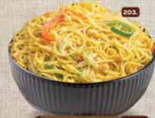
203. معكرونة بيض Egg Noodles AED 12.00