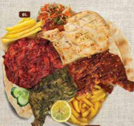
61. الفحم مشكل Mixed Charcoal