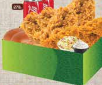
273. وجبة عائلية صغرى Mini Family Meal AED 40.00