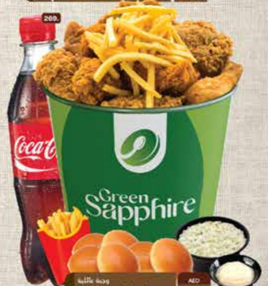
269. وجبة عائلية Family Meal AED 60.00

12pcs Chi+BBun+Fries+Garlic+1.5 L. Cola (قطعة دجاج + 2 خبز + 2 بطاطس + لوزم + كوكا كولا)