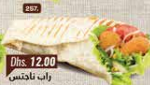
257. Nuggets Wrap Dhs. 12.00