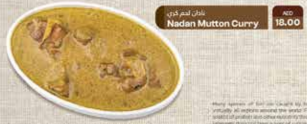
نادان لحم كاري Nadan Mutton Curry AED 18.00