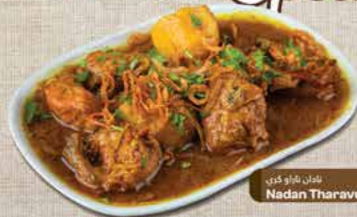
نادان تارافو كاري Nadan Tharavu Curry AED 18.00