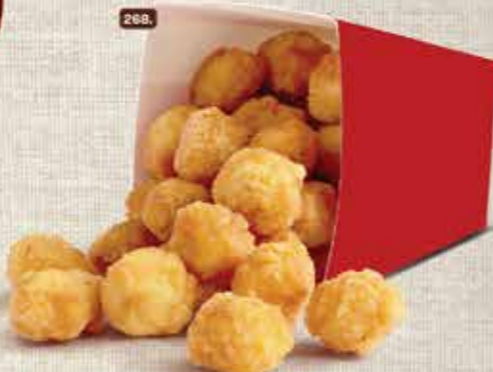
266. فشار Popcorn AED 10.00