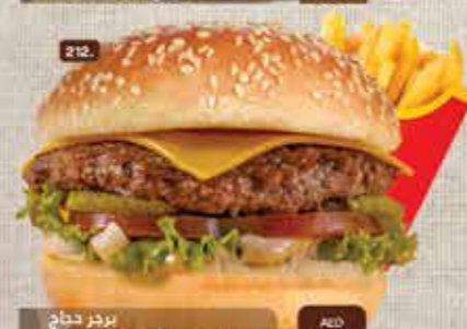
212. برجر دجاج Chicken Burger AED 7.00