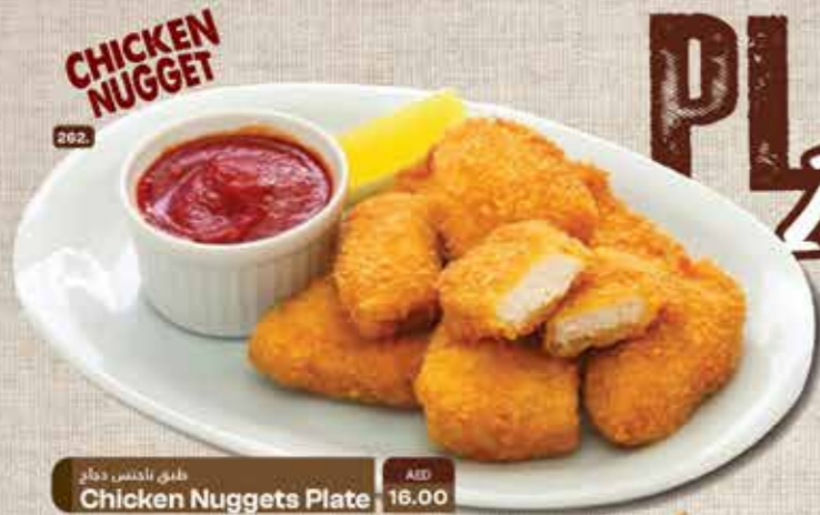
262. طبق ناغتس دجاج Chicken Nuggets Plate AED 16.00