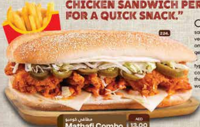
224. Mathafi Combo AED 13.00

Combo Sandwich, A sandwich is a food typically consisting of vegetables, sliced cheese or meat, on or between slices of bread, or generally any dish wherein the filling is contained in a container or wrapper for easy transport. The sandwich began as a convenient finger food in the 19th century, though over time it has become a worldwide.