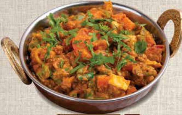
كاداي خضار Vegetable Kadai AED 8.00