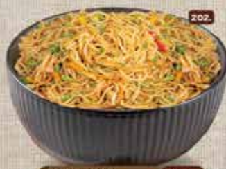
202. معكرونة خضار Vegetable Noodles AED 12.00