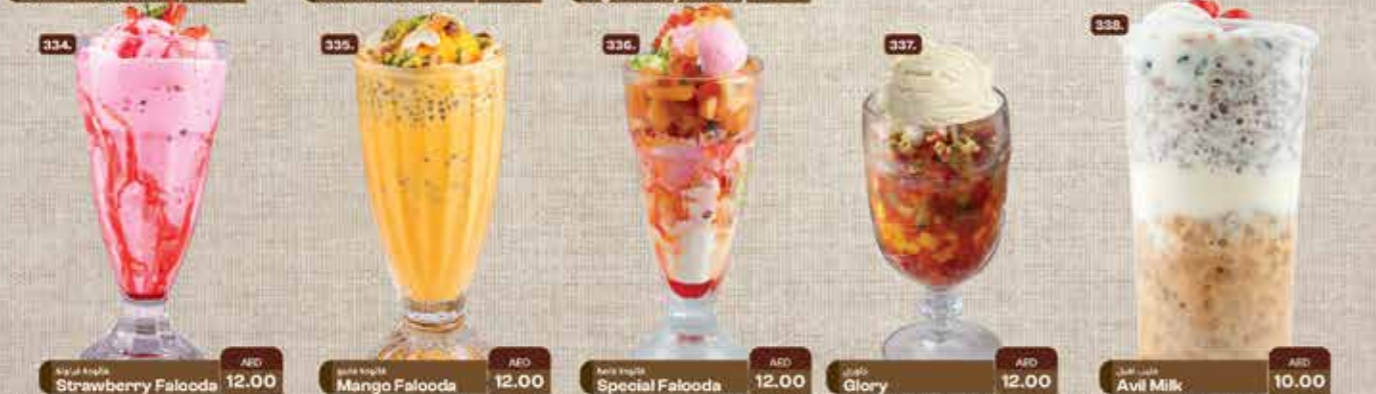
334. Strawberry Falooda AED 12.00 335. Mango Falooda AED 12.00 336. Special Falooda AED 12.00 337. Glory AED 12.00 338. Avil Milk AED 10.00