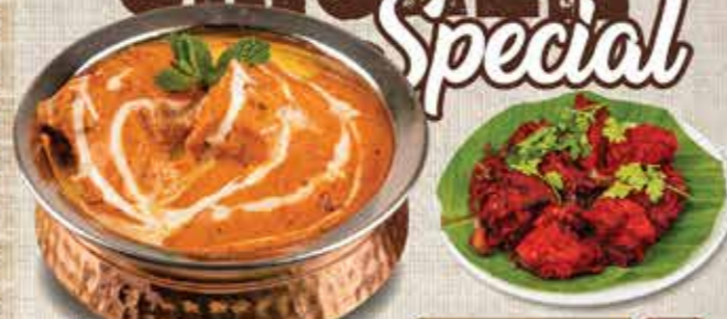
دجاج بالزبدة Butter Chicken AED 16.00 دجاج فلفل حار Chicken Chilly Fry AED 14.00