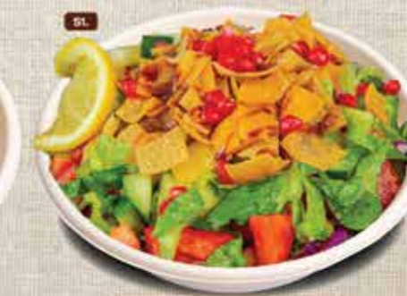
51. فتوش Fattoush AED 10.00