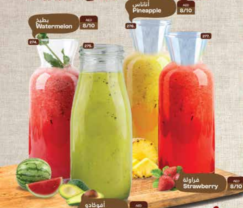
274. بطيخ Watermelon AED 8/10