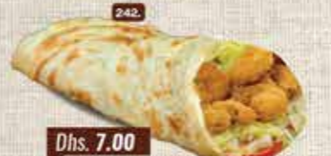
242. Jumbo Prawns Porotta Dhs. 7.00