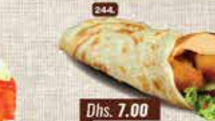
244. Nuggets Porotta Dhs. 7.00