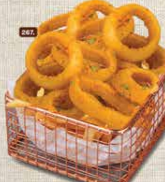
267. حلقات بصل Onion Rings AED 5/8/10