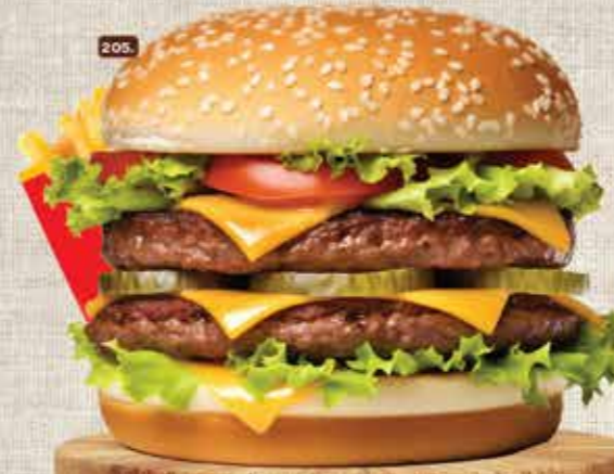
205. برجر لحم دبل Beef Double Burger AED 15.00

A cheeseburger is a hamburger with a slice of melted cheese on top of the meat patty, added near the end of the cooking time. Cheeseburgers can include variations in structure, ingredients and composition. As with other hamburgers, a cheeseburger may include various condiments and other toppings such as lettuce, tomato, onion, pickles, bacon, avocado, mushrooms, mayonnaise, ketchup, and mustard.