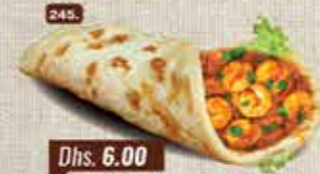
245. Prawns Porotta Dhs. 6.00