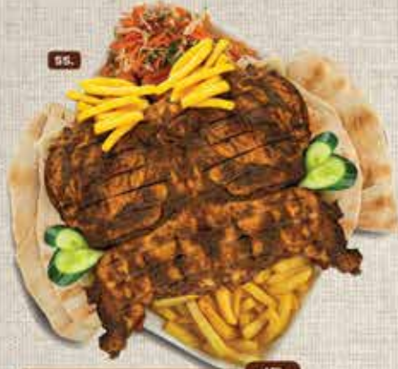
55. دجاج الفحم فلفل Pepper Chicken Charcoal

Grilling is a form of cooking that involves heat applied to the surface of food, commonly from above, below or from the side. Grilling usually involves a significant amount of direct, radiant heat, and tends to be used for cooking meat and vegetables quickly. Food to be grilled is cooked on a grill (an open wire grid such as a gridiron with a heat source above or below), using a cast iron frying pan, or a grill pan (similar to a frying pan, but with raised ridges to mimic the wires of an open grill).