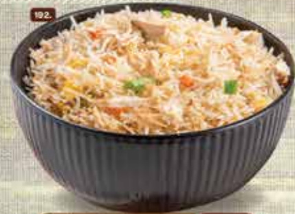
192. أرز مقلي دجاج Chicken Fried Rice AED 14.00