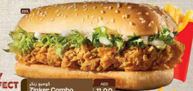
223. Zinker Combo AED 11.00

"A DELICIOUS AND HEARTY CHICKEN SANDWICH PERFECT FOR A QUICK SNACK."