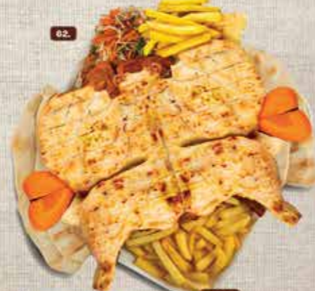
62. الفحم زبادي Yogurt Charcoal