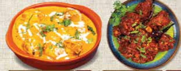
دجاج جوز الهند بالكاري Chicken Thenga Curry AED 14.00 دجاج كونداتام Chicken Kondattam AED 14.00