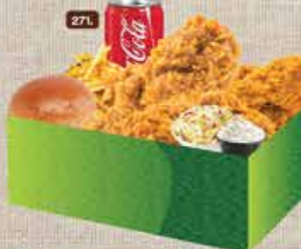
271. وجبة دجيز Dinner Meal AED 18.00