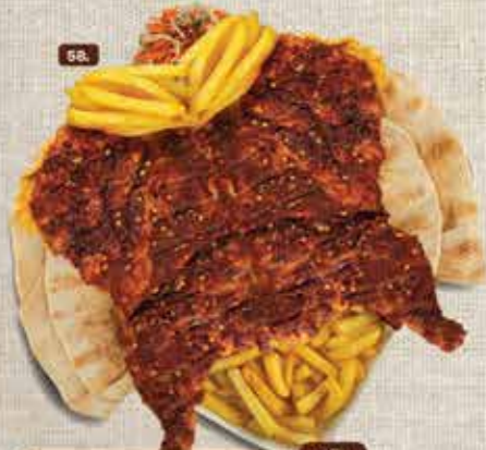
58. دجاج الفحم بيريوري Eri Porl Charcoal