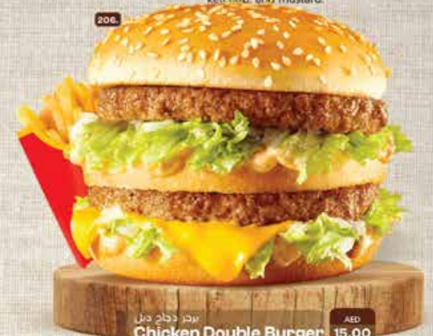
206. برجر دجاج دبل Chicken Double Burger AED 15.00